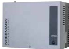
NORDMANN Omega medium without Display