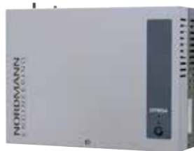
NORDMANN Omega small without Display