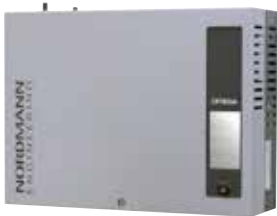
NORDMANN Omega small with Display

The Omega is a new generation of resistive heating steam generators.