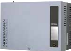
NORDMANN Omega medium with Display