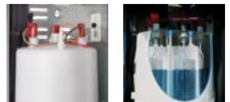
Long life steam cylinder

The Condair humidifier's SC system does not prevent the formation of limescale completely but it does make the interval between services significantly longer.